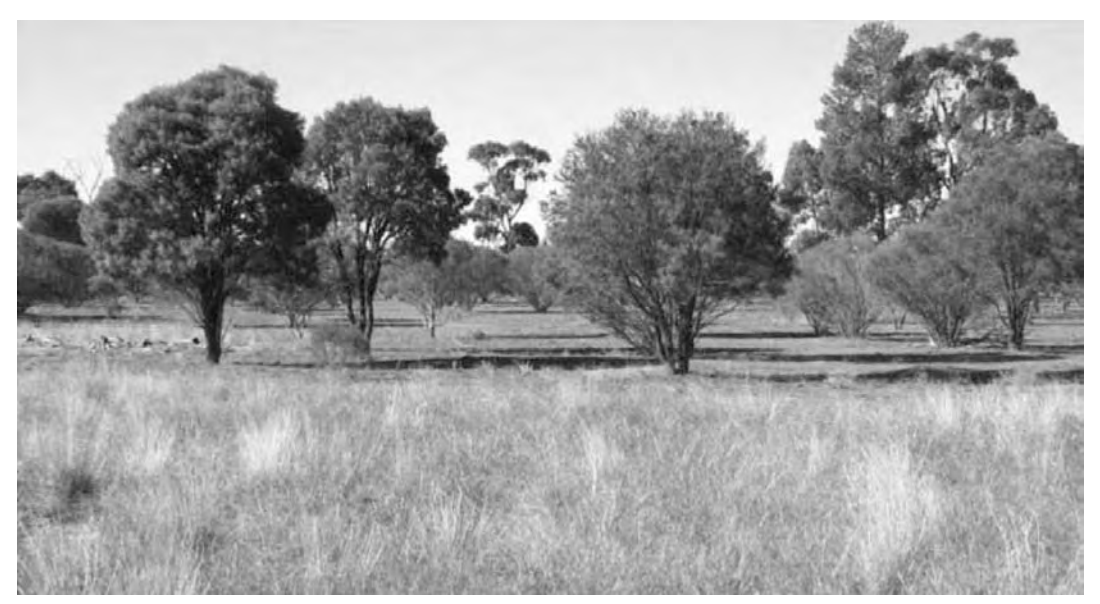
Figure 3. Combined pasture-cropping and planned grazing is a powerful recovery tool. The restored grassland in the foreground yielded 380 DSED/ha from a three week graze period in March 2008. This photo was taken in mid-June 2008. The undisturbed invasive native shrub country in the background still has no ground cover.

on our property and others in the Cobar area (Alemseged, 2009). These are