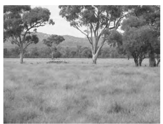
Figure 2. Thick and vigorous establishment of native perennial grasses in country managed for regeneration, March 2010 at 'Etiwanda', Cobar

Recent scientific testing on "Etiwanda" has shown positive environmental gains from changes in grazing management (Tighe et al. 2009). The data indicates increasing groundcover percentages, increasing soil carbon levels (0.6